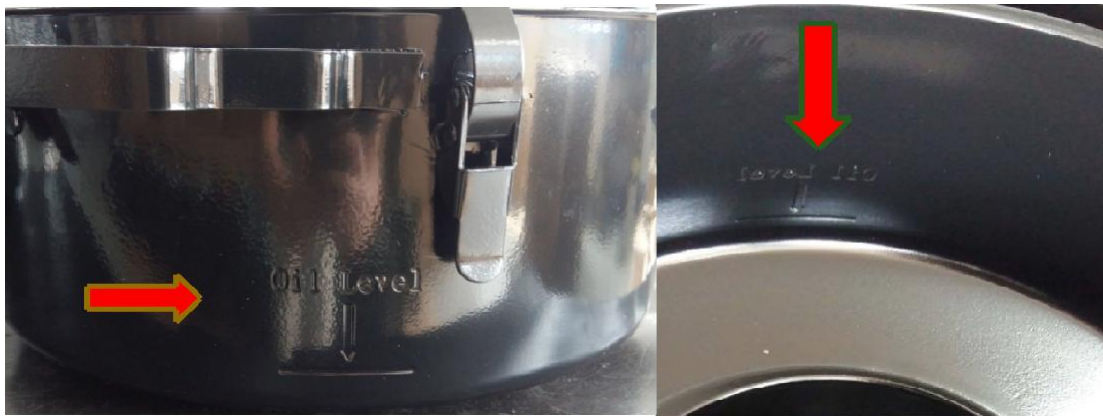
KAB88 Oil level indicated (inside lower casing)